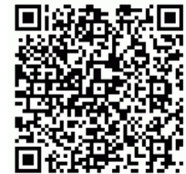
Employer Training Workshops